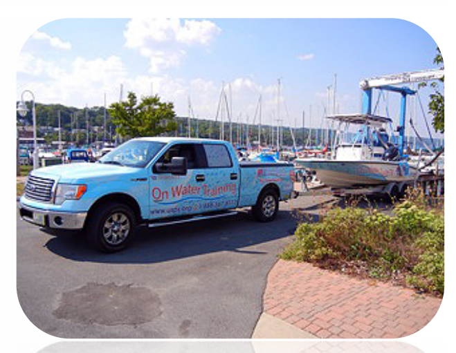
Water Trainer and her tow vehicle at the Watkins Glen Village Marina.

Reportedly a couple of our senior members took Water Trainer out on the lake to see what that 200hp Merc could do, but that is another story!