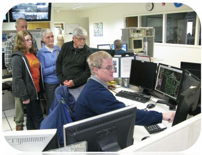
WX students are shown an overview of the data processed to create watch and warning "boxes".

The National Weather Service confirmed winds peaked near 110 mph and the tornado traveled 10 miles downing trees and power lines, and causing extensive damage to homes, buildings, and infrastructure in the town of Elmira.