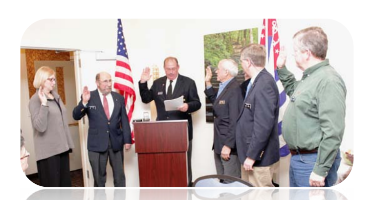
Swearing in of the Bridge members at the 2012 Change of Watch ceremony.

On January 20<sup>th</sup> we will have out annual Change of Watch and it marks the beginning of another year of our efforts to continue to provide education and training to both our members and to the general public.